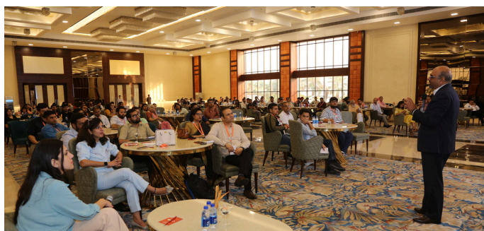
Senior Mentor guiding young entrepreneurs during InnoLEAD Startup Masterclass