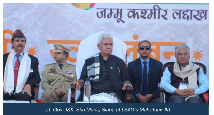
Lt. Gov. J&K, Shri Manoj Sinha at LEAD's Mahotsav-JKL