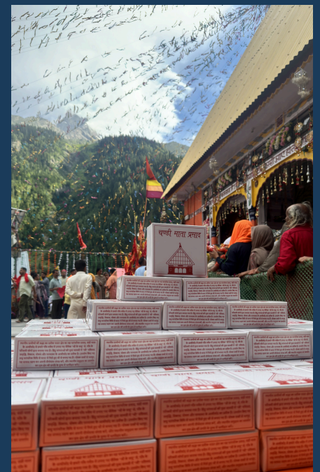
Livelihood Generation initiative of LEAD at Shri Chandi Mata Machail promoting local millet based prasad.