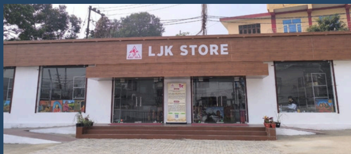
LEAD's LJK Store initiative promoting local products of Ladakh, Jammu & Kashmir. Store hosts more than 200 products from over 50 farmers and producers' group.