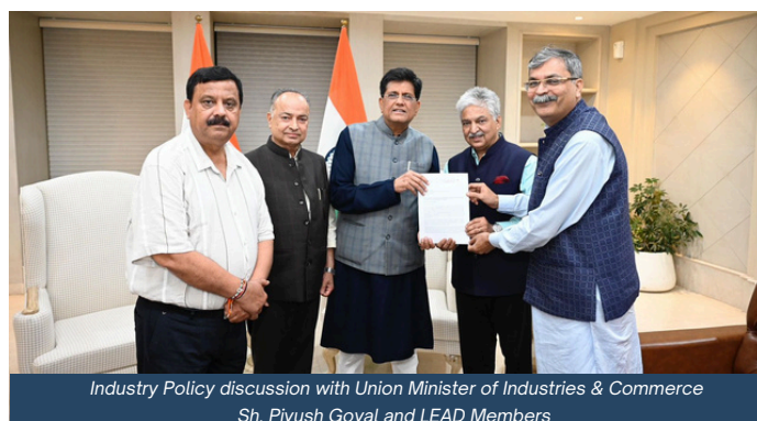
Industry Policy discussion with Union Minister of Industries & Commerce Sh. Piyush Goyal and LEAD Members