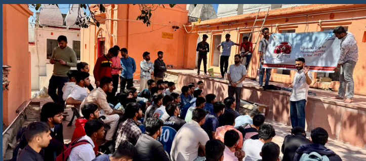
LEAD Facilitating educational visit of IIT Jammu students to Purmandal Heritage Site as part of our Vasudha Project