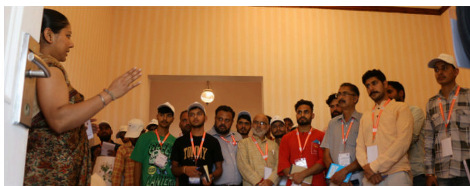
Participants during LEAD's Homestay Business Workshop